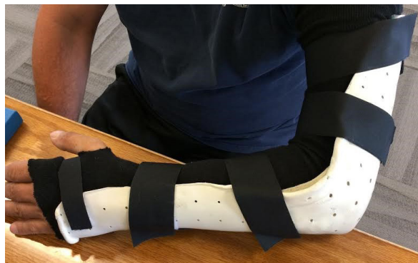
Example of a custom elbow orthosis for a radial head fracture

A hand therapist works directly with a doctor to assist with treating a radial head fracture. A custom orthosis to support and protect the elbow may be made. The therapist will also educate the patient on how to reduce swelling, decrease pain and regain motion and strength of the elbow, wrist and hand.