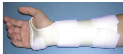
Custom-made orthosis to limit motion in a wrist with a ganglion cyst

A hand therapist will help determine which activities should be avoided. A hand therapist may also make a custom orthosis to limit joint motion. If surgery is performed, treatment will include exercises to restore the range of motion, strength and function of the hand. Other treatments may also be used to help manage pain and scarring.