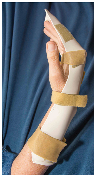
Example of flexor tendon orthosis to protect the injured finger

A hand therapist is an important part of post-surgical care. After surgery, the hand therapist will fabricate a custom-made orthosis and start a protected exercise program. The goals of therapy are to provide gentle motion to the healing tendon in order to prevent scarring and to prevent separation of the tendon. The physician, hand therapist and patient work together as a team in order to achieve the best possible outcomes after a flexor tendon injury.