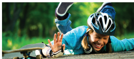
Example of a fall on an outstretched hand or wrist called a FOOSH

A distal radius fracture is usually caused by a fall on an outstretched hand or through contact sports and physical activities. Bones make up our rigid skeleton, and when a lot of force is put through them, they can break. A number of risk factors, such as low bone density or osteoporosis, may make it more likely for a distal radius fracture to occur.