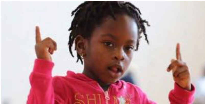
The Giving Hope Community Center

Every 30 seconds another person becomes a victim of human trafficking. This new Haven of Hope will provide shelter, training, ministry and love that hundreds of women need each year. They will be safe and free from trafficking, physical abuse and sexual abuse.