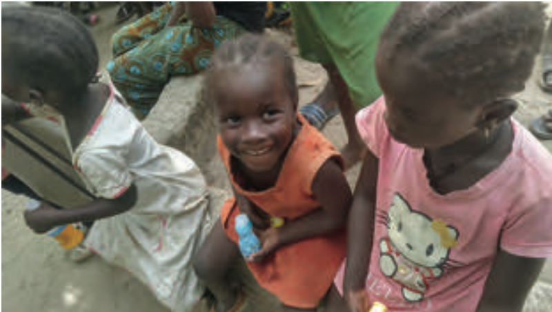
Hope House Orphanage in Gambia

The Giving Hope Community Center opens summer of 2018 to give individuals and families the opportunity, resources and tools to improve their lives and the lives of the 9th ward community. Our groundbreaking project will host a summer camp that will provide hot meals, recreation, and a safe environment for 100 children.